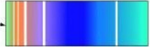
b Absorption line spectrum