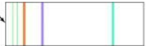
c Emission line spectrum